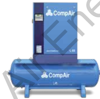
Receiver mounted compressor