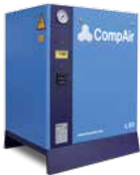
Compressor base mounted