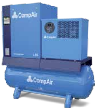
Complete airstation including compressor, dryer and receiver